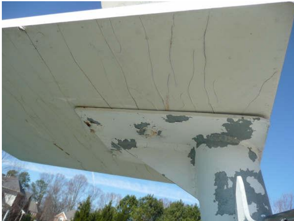
12. View showing the poor condition of the lifeguard platform at the competition pool.