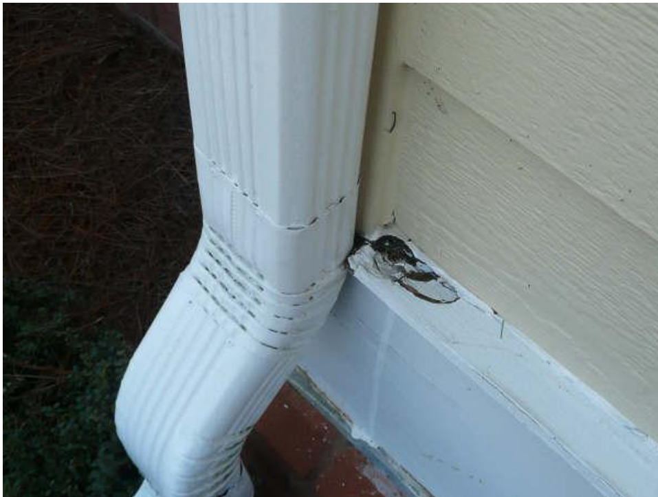
22. View showing deteriorated wood drip edge at the left front corner of the clubhouse.