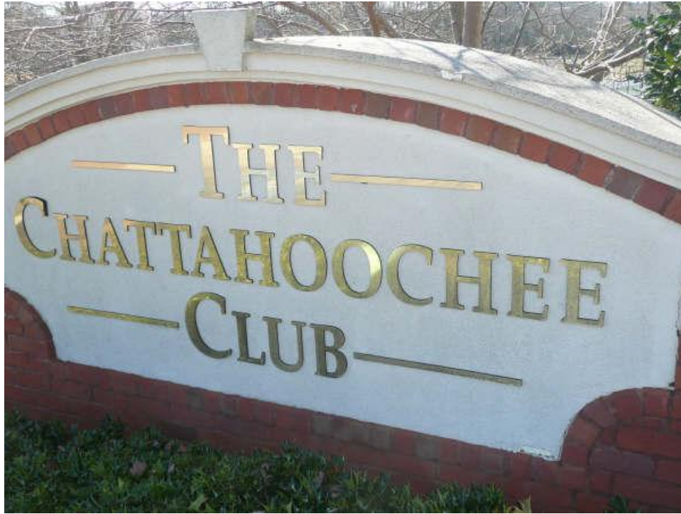
11. View of the monument sign at the clubhouse, showing the logo sign that is dirty, stained and damaged.