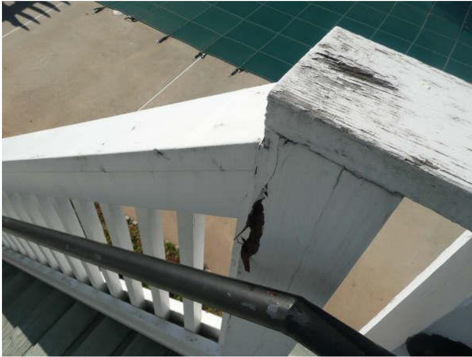
27. Deteriorated wood rail cap and post at the opposite side of the stairs at the clubhouse deck.