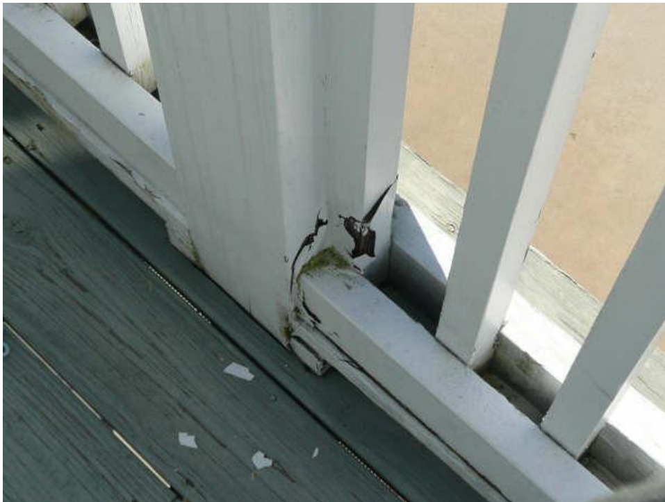
28. Deteriorated wood rail, post and picket at the bottom of the railing at the clubhouse deck.