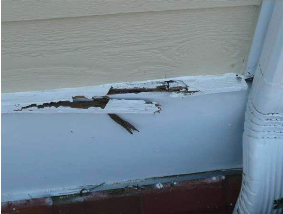
21. View showing deteriorated wood drip edge at the right front corner of the clubhouse.